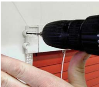
Step 5 Drill 2 x 2.5mm holes each side.