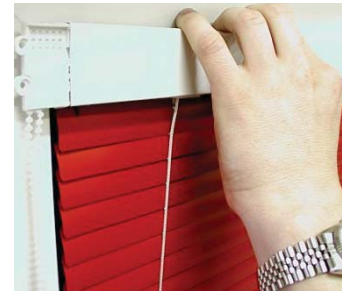
Step 4 Stick blind on frame.