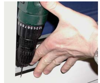
Step 8 Drill 1 x 2.5mm hole each side.