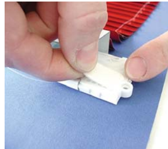
Step 3 Fix sticky pad (double sided).