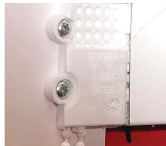
Step 11 Tuck excess guide wire behind the headrail. You should have enough to re-tension if required.