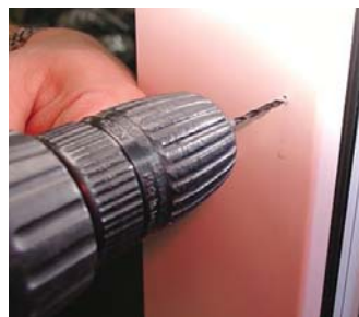
Step 14 Drill 2 x 2.5mm holes. Do not on any account drill too close to the edge of the window bead.