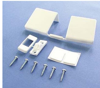
Step 2 Accessories pack.