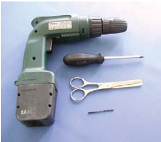
Step 1 Fitting tools required.