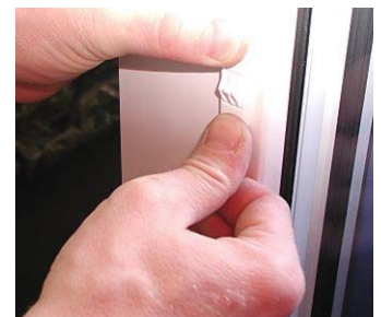
Step 16 Clip on cover to hide fixings.