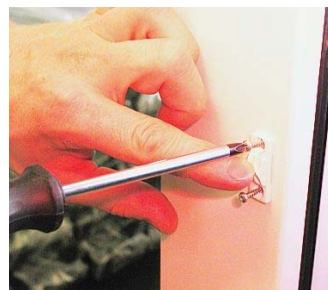
Step 15 Hand screw small fixings. These fixings should be no longer than 20mm.