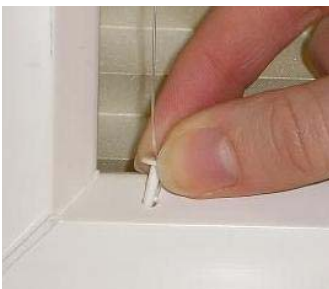
Step 9 Push guide wire into hole, knot first. Push fixing plug into hole. This secures bottom of blind.