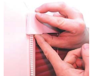
Step 12 Ensure that guide is fully tucked in behind headrail. The cover cap now clips on.