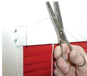
Step 10 Pull cord tight and lock in place with door - release. Cutt off excess guide wire, 100mm from end.